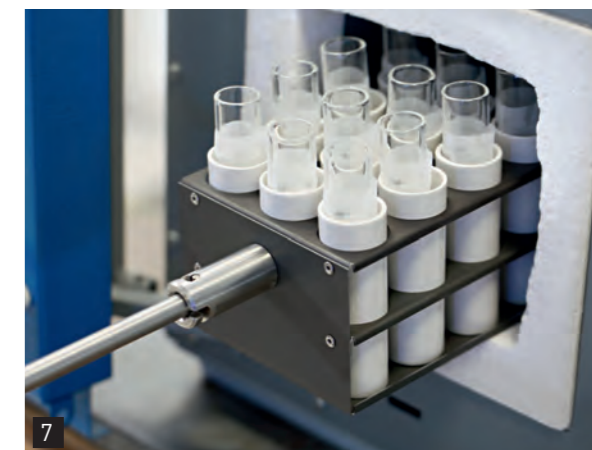
The incinerating module with a long handle makes handling of samples easier.