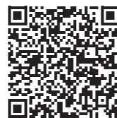
Scan the QR code and watch our FIBRE THERM® video.

“FIBRE THERM® standardises fibre analysis in feedstuffs, reaching a new level of quality, making it more economical, more precise and more reliable.”