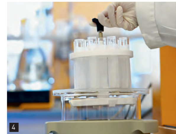
The removable handle makes it easier to insert and remove the sample carousel.